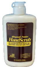
Hygenall HandScrub P/N: HHSP16