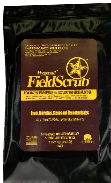
★ Hygenall FieldScrub P/N: FSHT5014

55 Gallon Drum.....P/N: HHSP55G Pump for 55 Gal Drum.....P/N: 55PGHBW90006 5 Gallon Pail.....P/N: HHSP05G